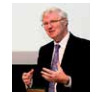
Lord Nigel Crisp KCB

Director, NHS Sustainable Development Unit, NHS England and Public Health England, UK