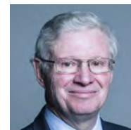
Lord Nigel Crisp

Independent crossbench member, House of Lords; Co-chair, All-Party Parliamentary Group on Global Health, UK