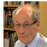
Sir Michael Marmot

Sustainable Development Institute, Monash University, Australia