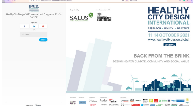
Event log in page

You can log into the event and start learning about the sessions, view other attendees and virtual booths, send messages and set up meetings as soon as you're registered.